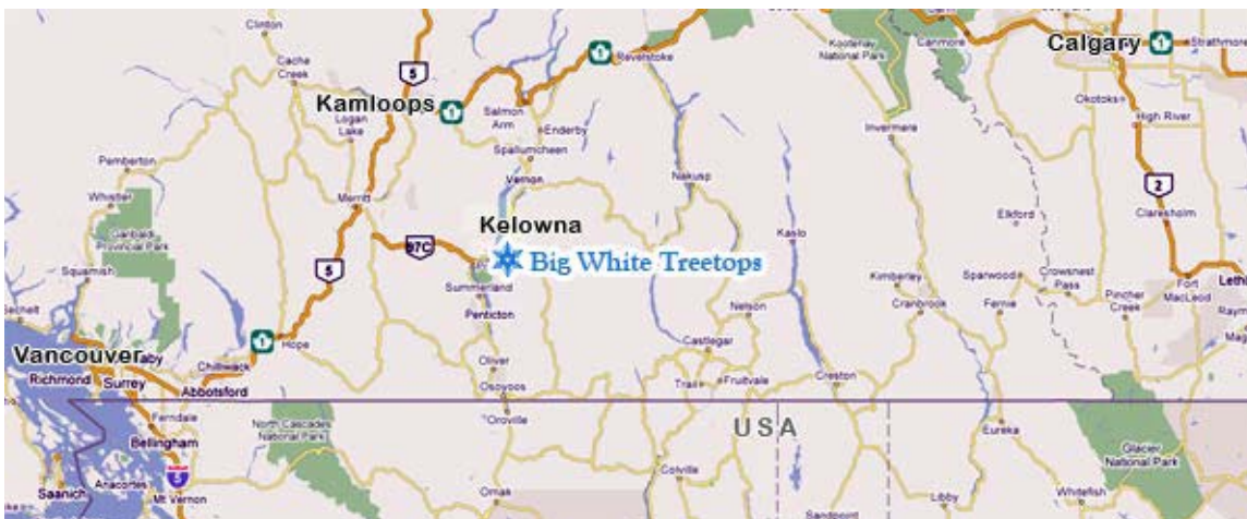
Map of Kelowna BC & Big White Ski Resort

Exit the Kelowna International airport onto Highway 97 South and follow the signs towards Kelowna. As you enter the Rutland area you will see the large green highway signs displaying the turn off for Highway #33 and Big White. Turn left at the highway #33 intersection, get your coffee at Tim Horton's, stop at Costco for some goodies and then proceed on Highway #33 for 26 KM to the Big White Turn off.